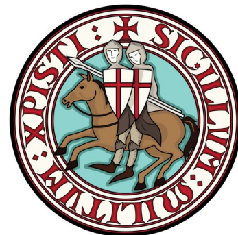
Symbol of the Order